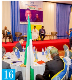
16 International Day For Human Rights Celebration