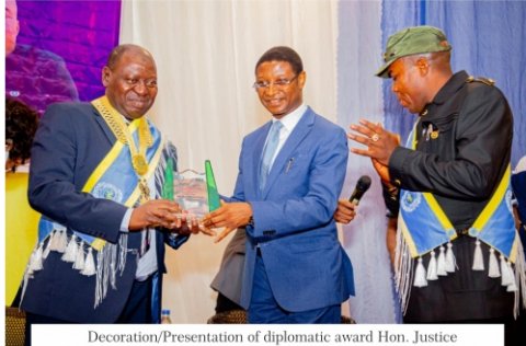
Decoration/Presentation of diplomatic award Hon. Justice Kazeem Alogba, Chief Judge of Lagos State High Court of Justice