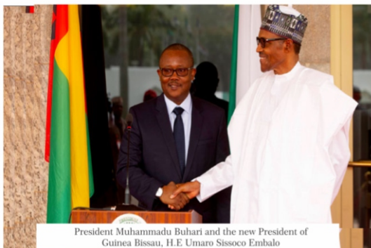
President Muhammadu Buhari and the new President of Guinea Bissau, H.E. Umaro Sissoco Embaló