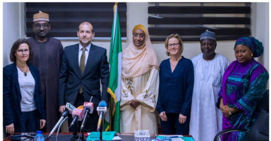
Ministry Seeks To Partner With Switzerland On Humanitarian Intervention - Federal Ministry of Information and Culture