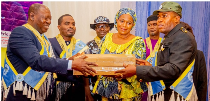
Donation of laptop computers specially configured with Law Pavilion to the National Agency for Prohibition of Trafficking in Persons (NAPTIP) at the occasion of International Day for Human Rights Celebration in Sheraton Abuja Hotels. Held on December 10, 2021

violence against persons and trafficking in persons.