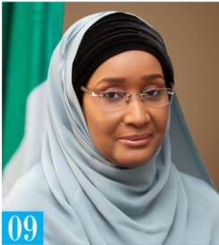
09 Ministry of Humanitarian Affairs