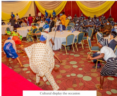
Cultural display the occasion