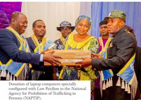
Donation of laptop computers specially configured with Law Pavilion to the National Agency for Prohibition of Trafficking in Persons (NAPTIP).