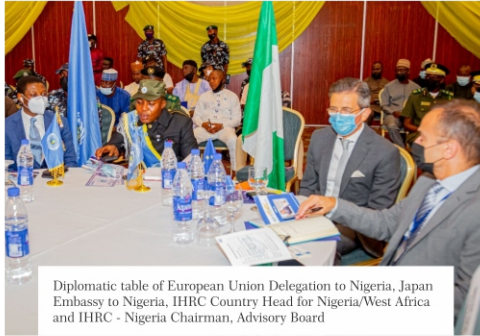
Diplomatic table of European Union Delegation to Nigeria, Japan Embassy to Nigeria, IHRC Country Head for Nigeria/West Africa and IHRC - Nigeria Chairman, Advisory Board