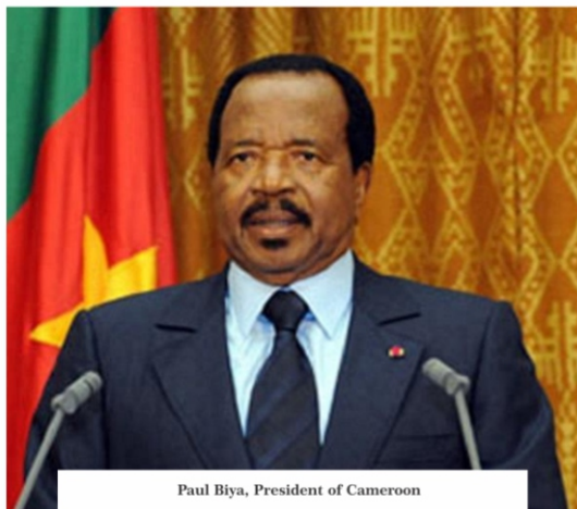
Paul Biya, President of Cameroon

The Nigeria/West African central office of International Human Rights Commission (IHRC) has advised the government of the Republic of Cameroon against the use of military to settle civil unrest because of its negative consequences bearing in mind that the use of military in a democratic governance to resolve civil uprising can be counter productive.