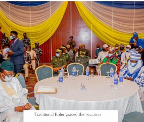
Traditional Ruler graced the occasion