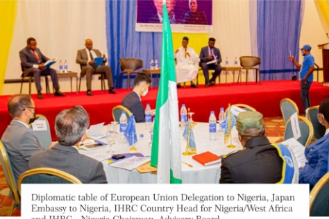
Diplomatic table of European Union Delegation to Nigeria, Japan Embassy to Nigeria, IHRC Country Head for Nigeria/West Africa and IHRC - Nigeria Chairman, Advisory Board