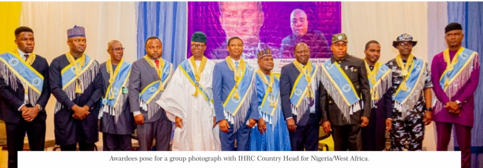
Awardees pose for a group photograph with IHRC Country Head for Nigeria/West Africa.