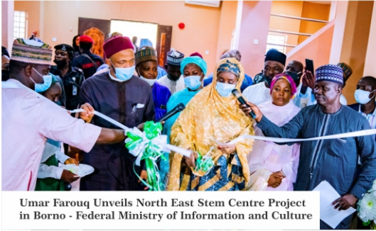
Umar Farouq Unveils North East Stem Centre Project in Borno - Federal Ministry of Information and Culture

farmers' conflicts or banditry in certain parts of Nigeria, as well as another 800,000 people in areas that are inaccessible to international humanitarian actors in the North-East.